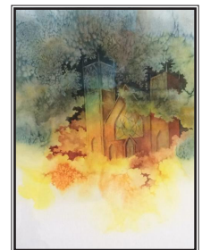
Above: Painting of Painesville Methodist Church