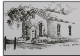
Above and Below: Sketches at Perry Historical Society