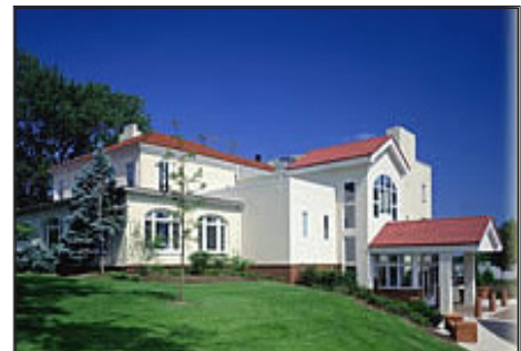
Pine Ridge Country Club