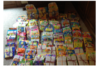
Above: Packages for TriPoint Donations Below: Books for Babies Committee

Thank you in advance for your generosity in this ongoing annual project! Let's try to top last year's donations!