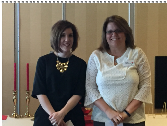
Gamma Theta Scholarship Winners