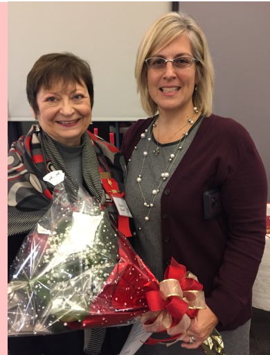
Fall 2018 Gamma Theta Initiates