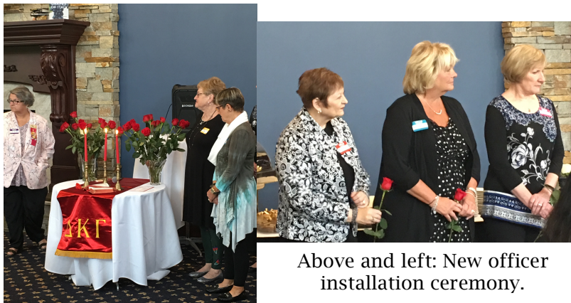
Above and left: New officer installation ceremony.