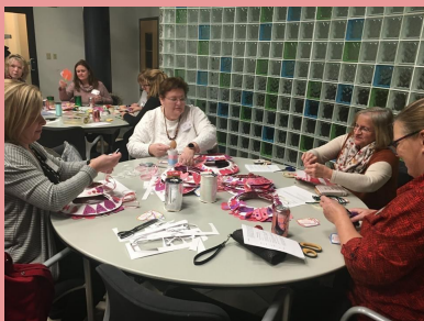
Members tagging and sorting crafts to get ready for delivery.